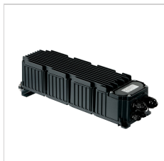
3109422 Driver box 1500 - 1,4 A - 3 CH - DMX